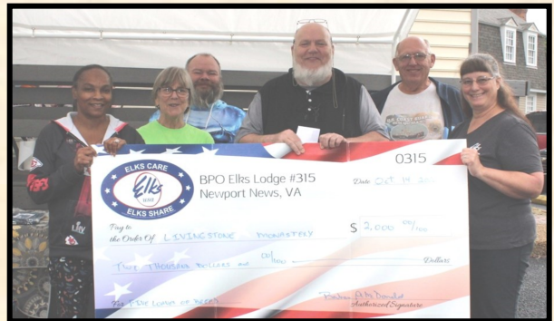
Livingstone Monastery October 14, 2023