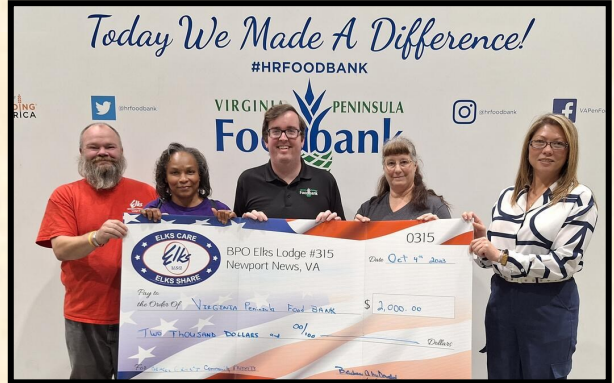
Virginia Peninsula Food Bank October 4, 2023

Funds for these two programs were provided by the "Beacon grant" applied for and approved by the Elks National Foundation.